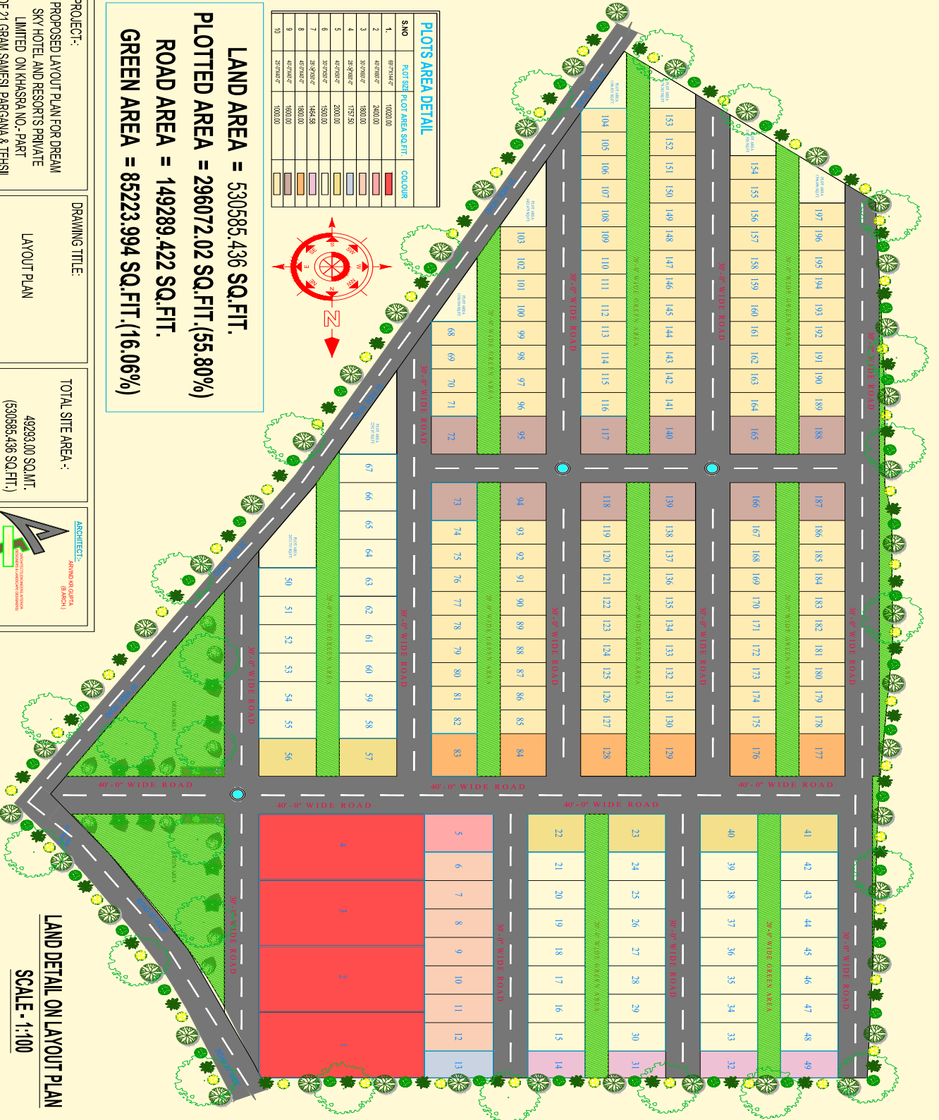
LAND DETAIL ON LAYOUT PLAN